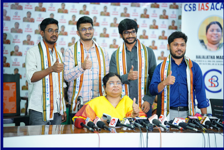
UPSC CSE-2022 Rankers