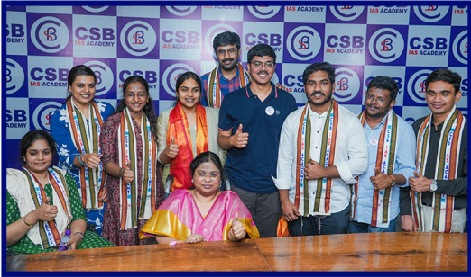
UPSC CSE-2023 Rankers