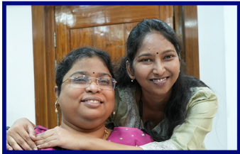
Arugula Sneha AIR-136, 2021