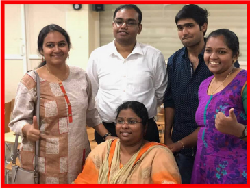
UPSC CSE-2018 Rankers