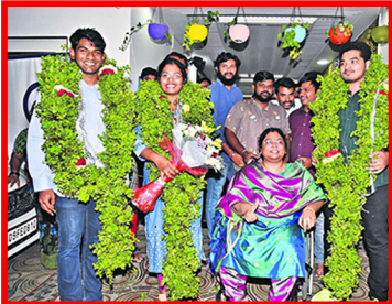
UPSC CSE-2020 Rankers