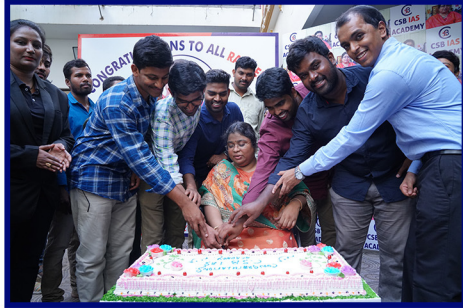
UPSC CSE-2021 Rankers